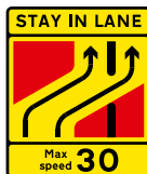
One lane crossover at contraflow road works